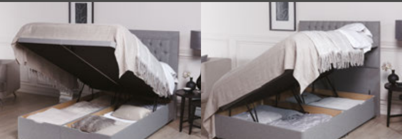
End Lift Option